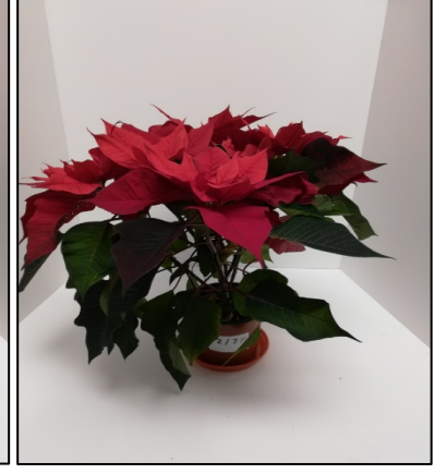
Figure 2. Infinity plants, grower 2, shelf life 17<sup>th</sup> November (left) and 12<sup>th</sup> January (right) showing colour softening.